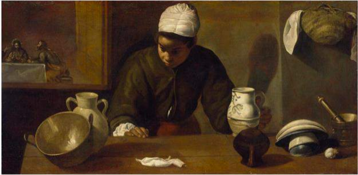
Diego Velázquez (1599-1660), 'Kitchen Maid with the Supper at Emmaus', c.1617-1618.

Warm Easter greetings to all members of the Boonah Catholic community and beyond!