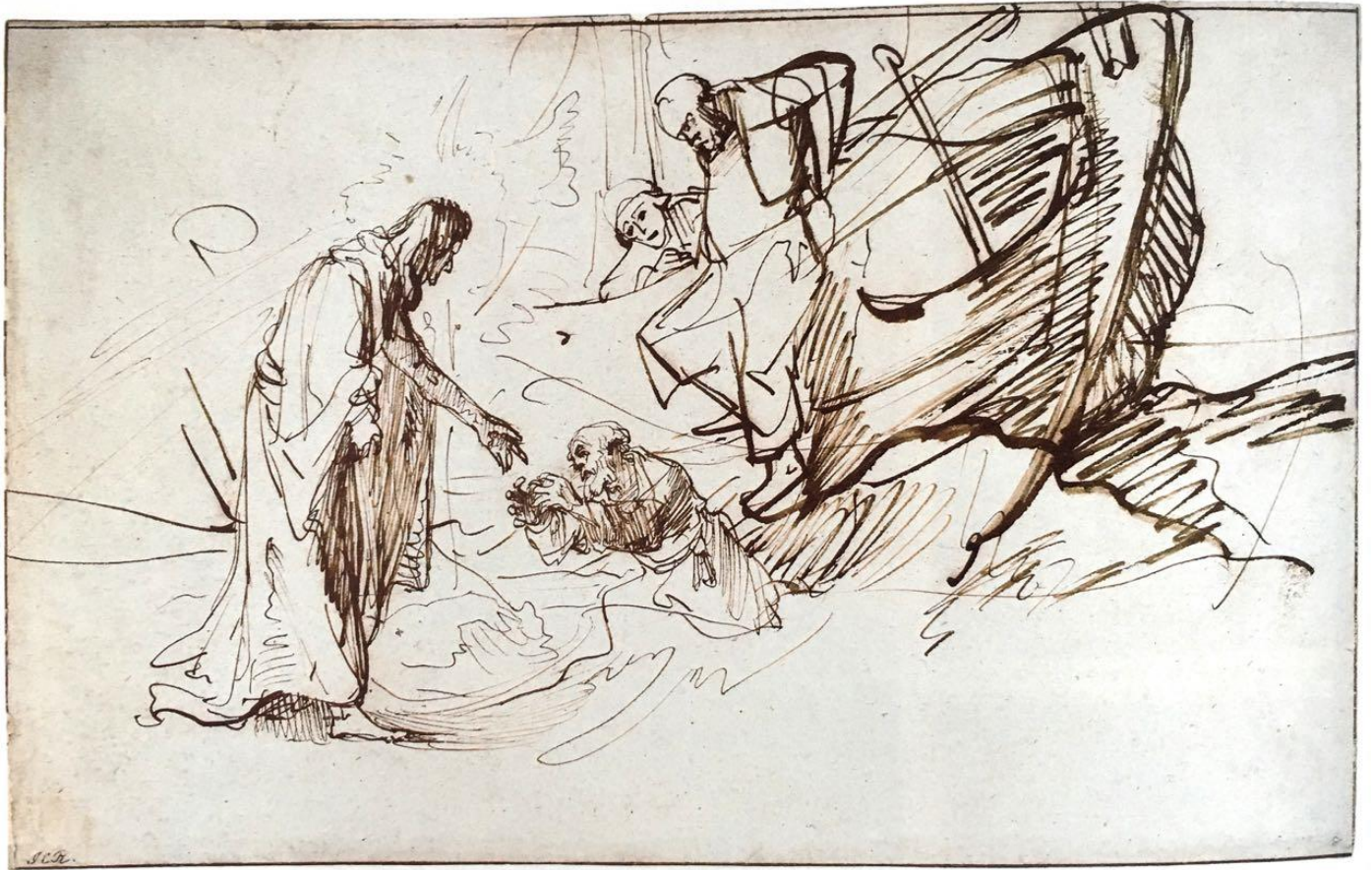
Rembrandt's "Christ Walking on the Water" 1638, from the British Museum